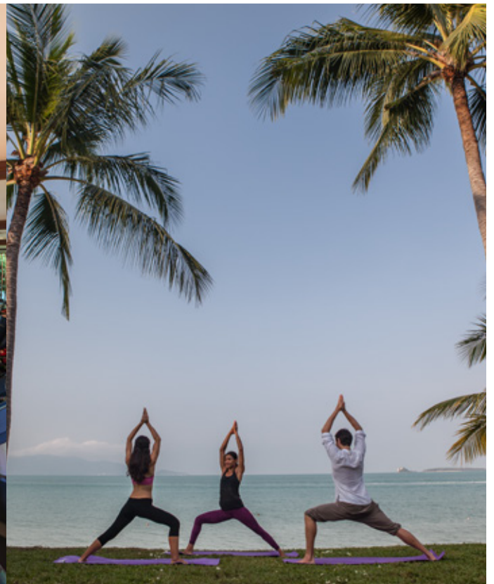
Group Recreation Classes