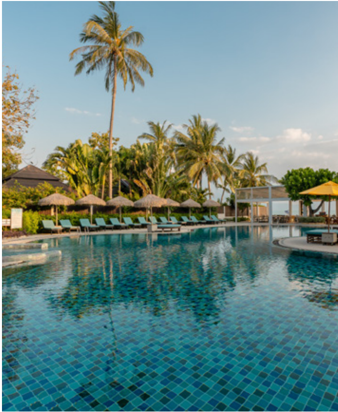
Pool and Jacuzzi